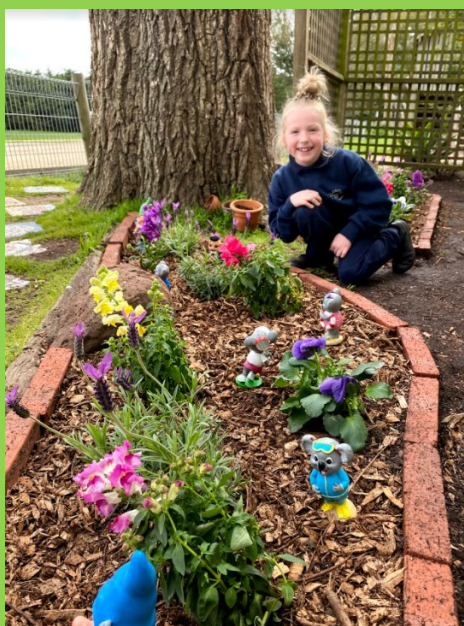
Work in progress

We are currently asking for Gnomes to put into the fairy garden.